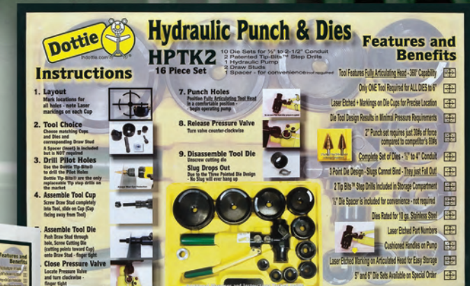
Full Color Instructions on Box and Inside the Case.