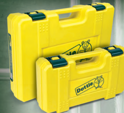
Heavy Duty Bullet Proof Carrying Cases